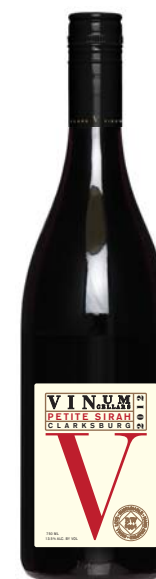
[2012 PETITE SIRAH]

100% Chardonnay Appellation: Monterey Alcohol: 13.5% TA (g/l): 7.0 pH: 3.70 Production: 3,500 cases