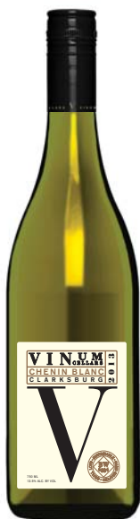
[2013 CHENIN BLANC]

100% Chenin Blanc Appellation: Clarksburg Alcohol: 13.4% TA (g/l): 7.1 pH: 3.35 Production: 2,200 cases