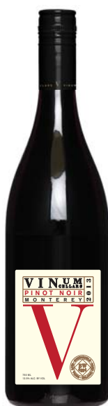
[2013 PINOT NOIR]

100% Chenin Blanc Appellation: Clarksburg Alcohol: 13.4% TA (g/l): 7.1 pH: 3.35 Production: 2,200 cases